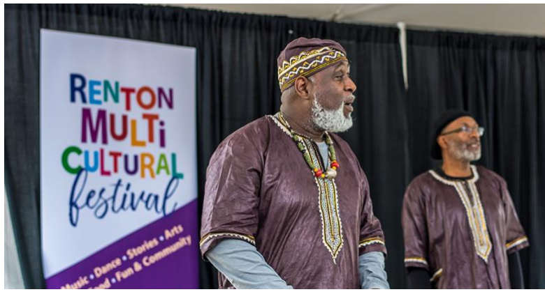
The Renton Multicultural Festival on Sept.18 is partially funded by a grant from the first round of Lodging Tax Funding.